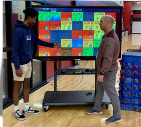
The Big Board Data Display